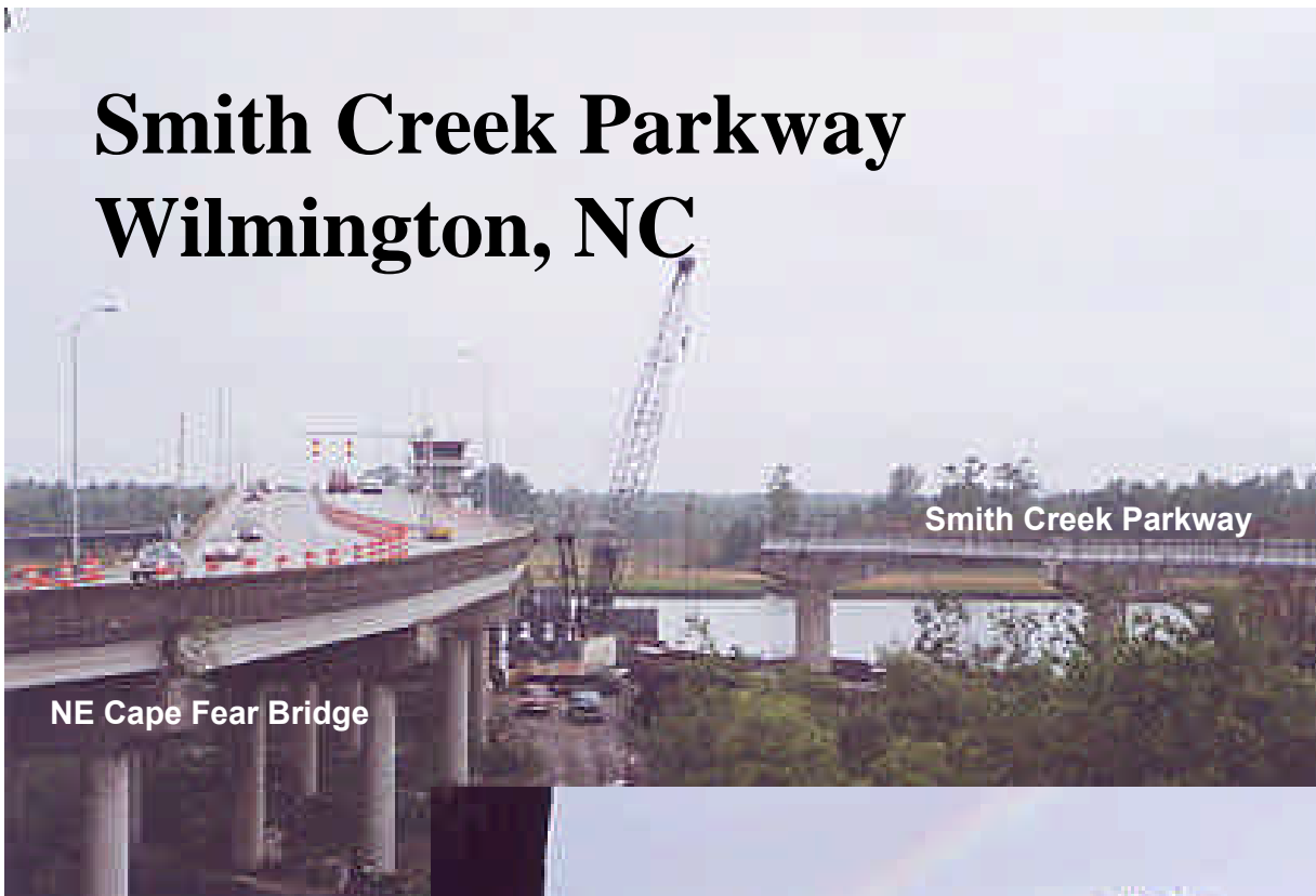
NE Cape Fear Bridge